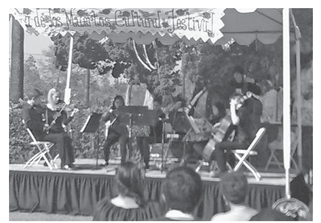
Music and live performances were part of the day's celebration. Playing the favorite songs of the dead relative is just another way that Dia de los Muertos celebrates the life of those no longer alive.