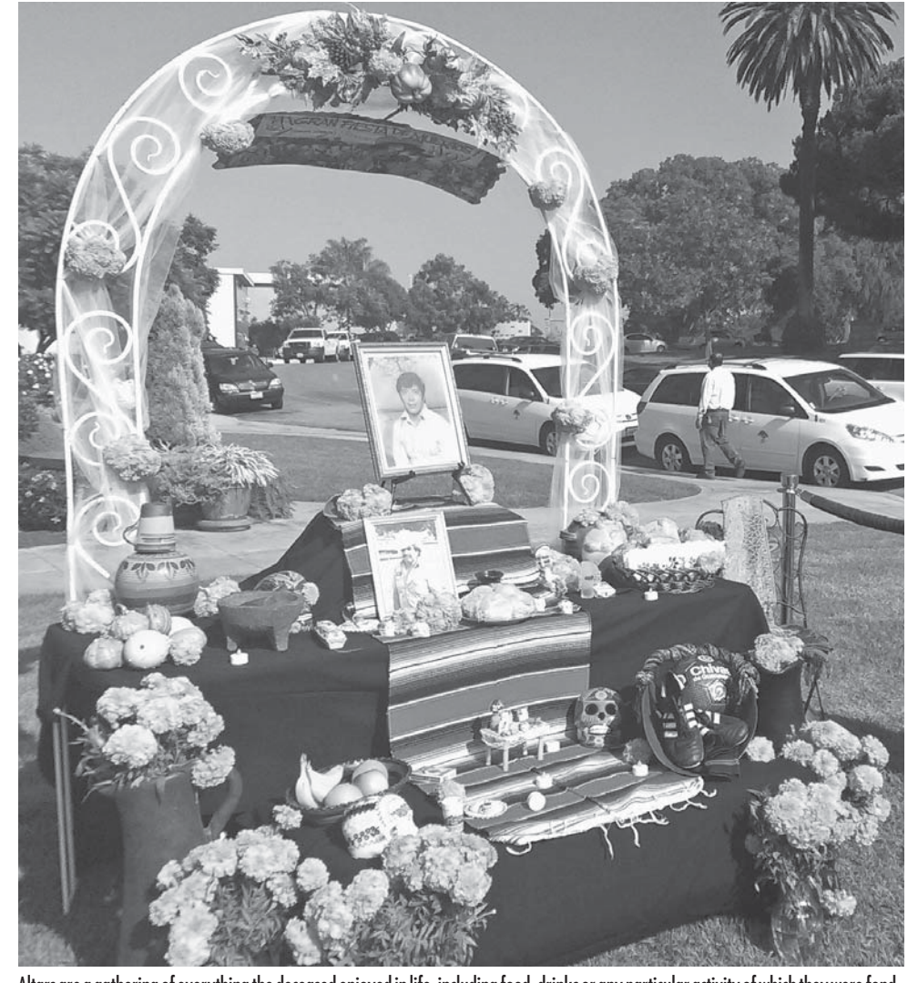
Altars are a gathering of everything the deceased enjoyed in life, including food, drinks or any particular activity of which they were fond.