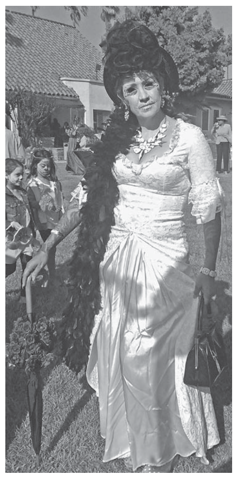
Part of celebrating the life of the deceased during Dia de los Muertos includes masks or makeup resembling one of the most popular figures of the celebration, "La Catrina." La Catrina has become the referential image of death and embodies people's ability and willingness to laugh and celebrate despite the tragedy of death.