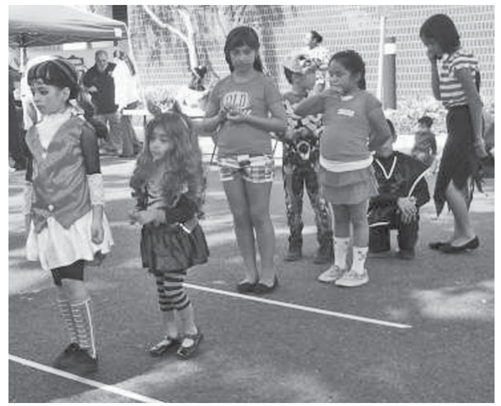
South Bay kids attend the Halloween Safety Event in their Halloween best.